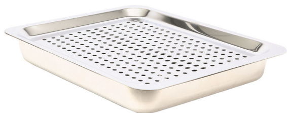
KB-SSTRAY Stainless Steel Drip Tray