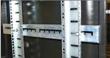
Quick Adjust System