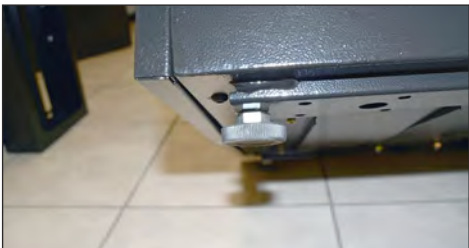
H/D Load bearing levelling feet