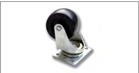
Roll into position Castors (option)