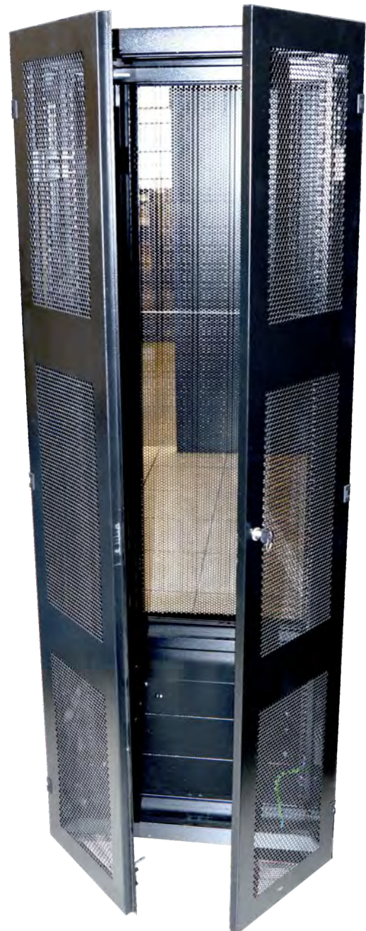
Saloon type rear doors