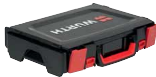
Closures with recessed handles