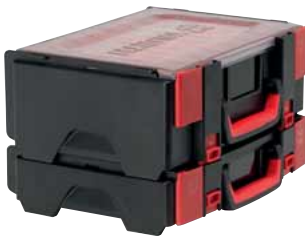
Connect several cases