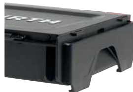
All-round red elastomer seal