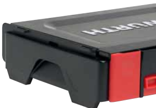
Lateral recessed handles