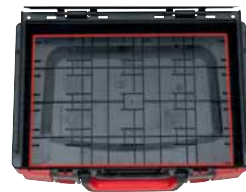
Homogeneous inner surface