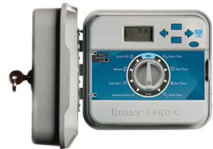
Plastic Outdoor Height: 22.9 cm Width: 25.4 cm Depth: 11.4 cm