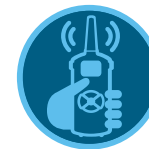
ROAM Remote ROAM XL Remote