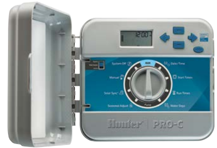
Plastic Indoor Height: 22.9 cm Width: 25.4 cm Depth: 11.4 cm