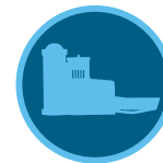
Solar Sync Sensor