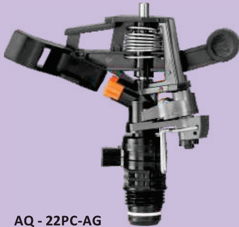
AQ - 22PC-AG