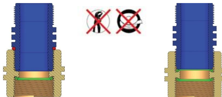
Seal on male thread O-ring