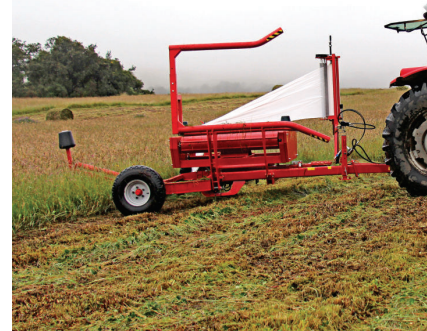
MW 200 - 300 | Bale wrappers