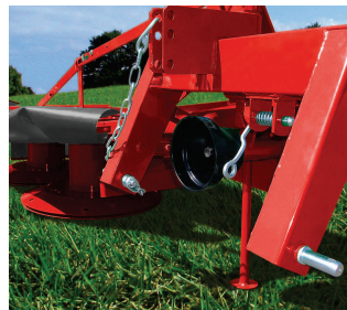
Heavy duty 3 point hitch.