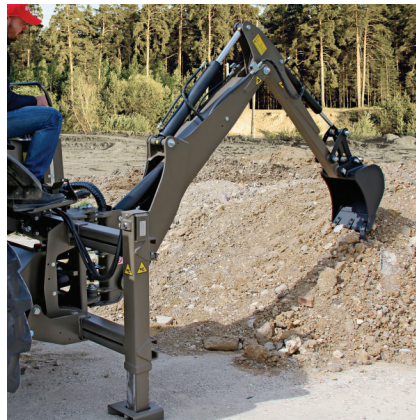
MB - MF | Fixed and Side-shift backhoes