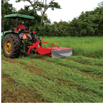
MT | Rotary Drum Mower