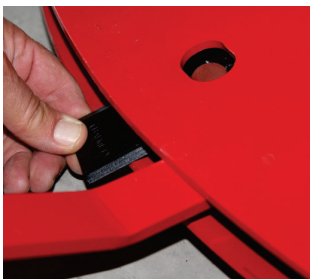
Easy system knives replacement.