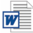
Microsoft Word (.docx)