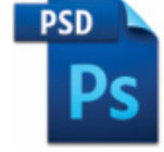
Adobe Photoshop (.psd)

Non-Vector artwork can be used In all Digital Processes and Embroidery.