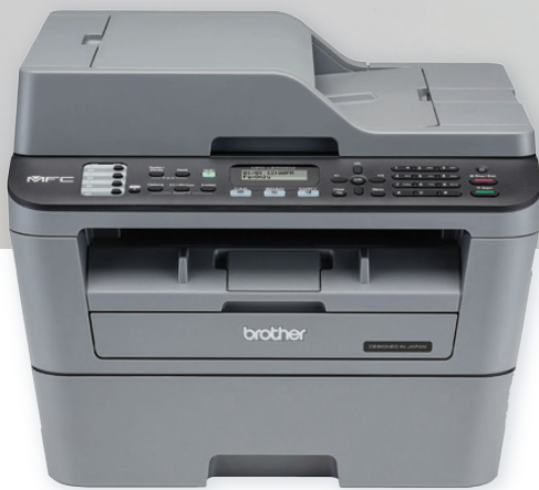
MFC-L2700DW Black & White Laser Multifunction Printer

Empower your business with an outstanding performer that won't let you down. Designed for enhanced productivity and cost-efficiency, Brother's range of black and white laser printer and multifunction printer series combine wireless and mobile printing, scanning and copying capabilities to deliver office-wide productivity that you can count on.