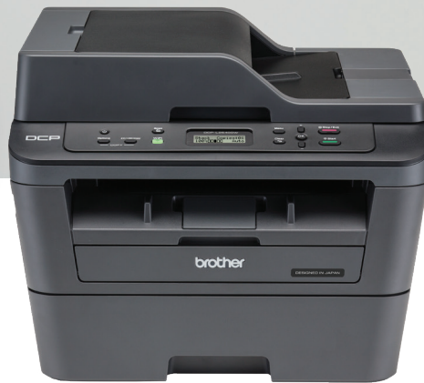
DCP-L2540DW Black & White Laser Multifunction Printer