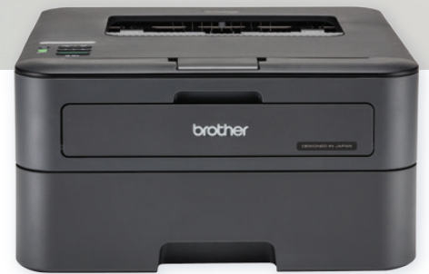
HL-L2365DW Black & White Laser Printer