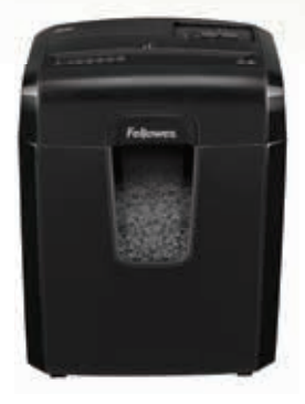
Microshred 8Mc PERSONAL USE. 1 USER.

Microshred 10M SMALL OFFICE USE. 1 USER.